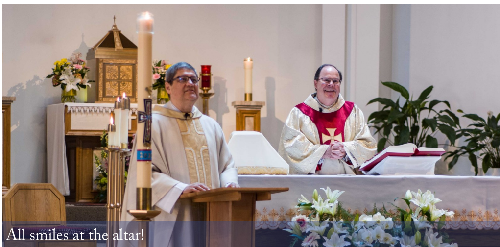
All smiles at the altar!