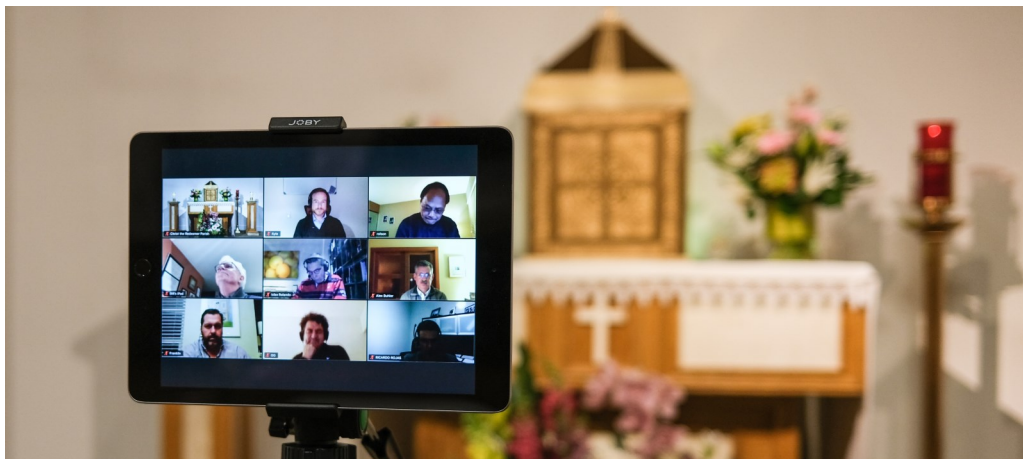
The Men's Prayer Group prays in front of the tabernacle via Zoom