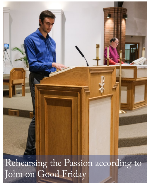
Rehearsing the Passion according to John on Good Friday