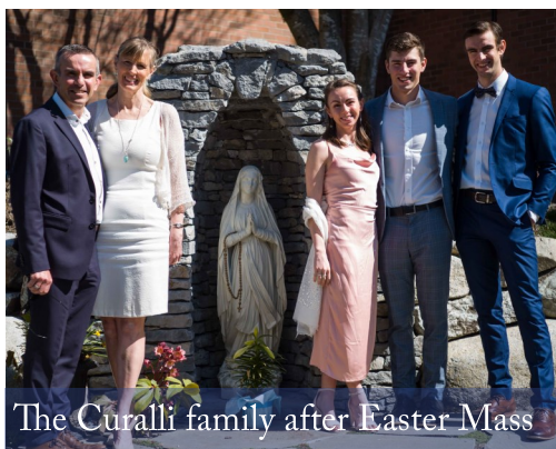
The Curalli family after Easter Mass