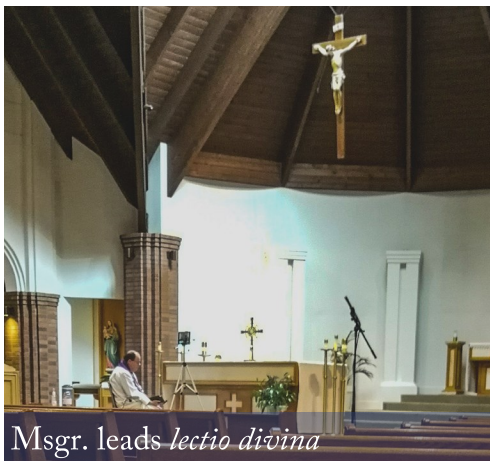
Msgr. leads lectio divina