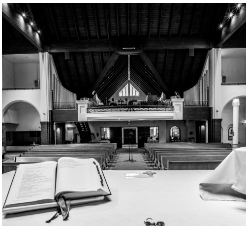
The priests' view of Mass

Here are some more scenes from the parish and parishioners over the past few weeks! #ChurchNeverStops