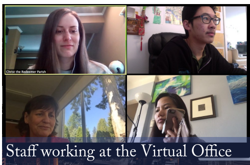
Staff working at the Virtual Office