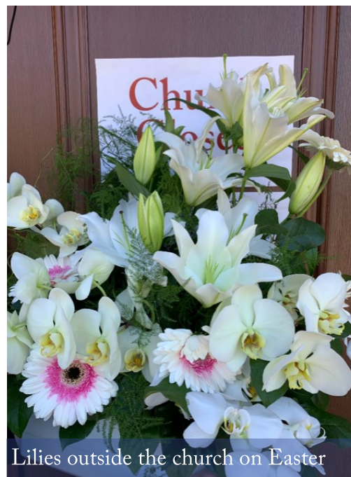
Lilies outside the church on Easter