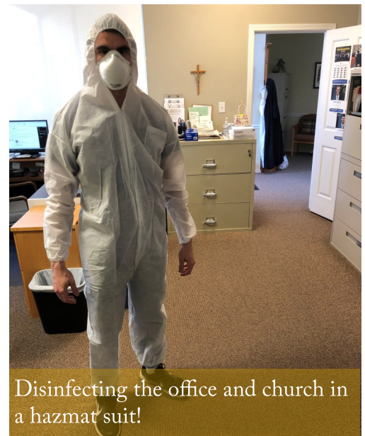
Disinfecting the office and church in a hazmat suit!