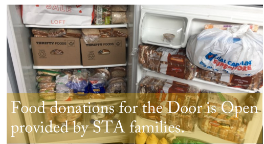
Food donations for the Door is Open provided by STA families.