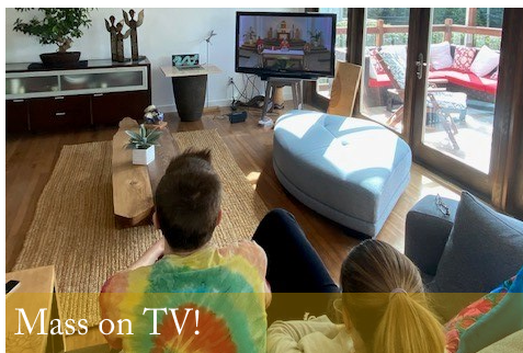
Mass on TV!