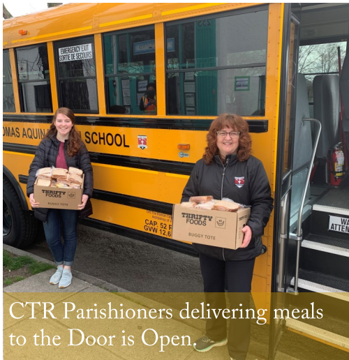
CTR Parishioners delivering meals to the Door is Open.

Here are some scenes from the parish and parishioners over the past few weeks! #ChurchNeverStops