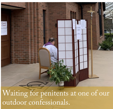
Waiting for penitents at one of our outdoor confessionals.