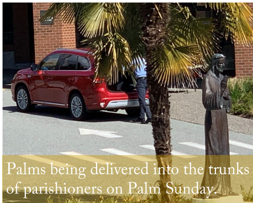
Palms being delivered into the trunks of parishioners on Palm Sunday.