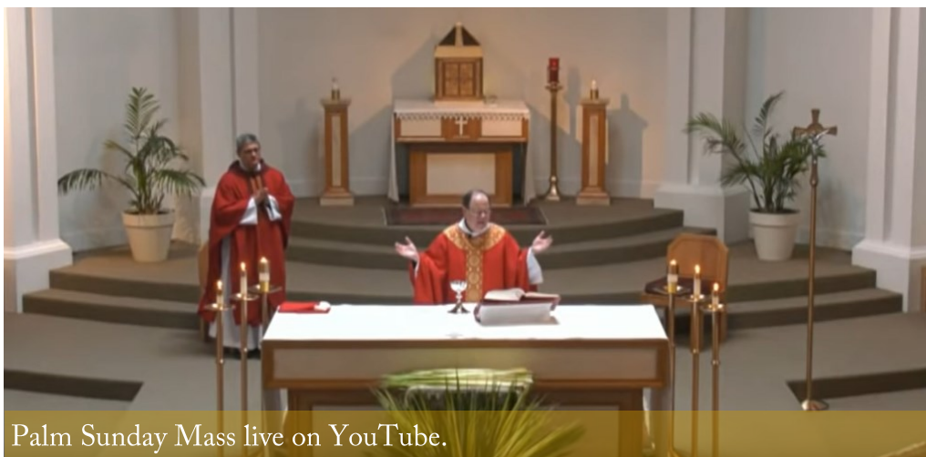
Palm Sunday Mass live on YouTube.