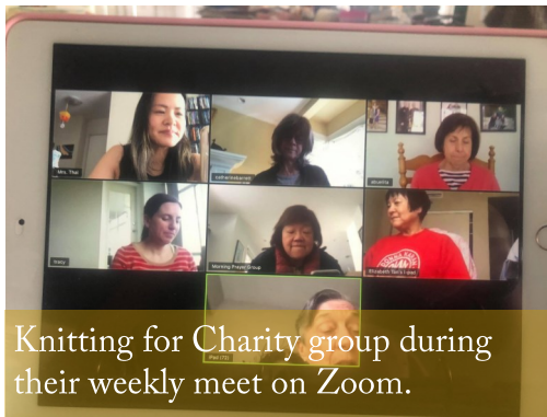
Knitting for Charity group during their weekly meet on Zoom.